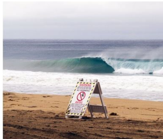
Human Pathogen Health Risk