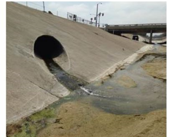
Unnatural Water Balance